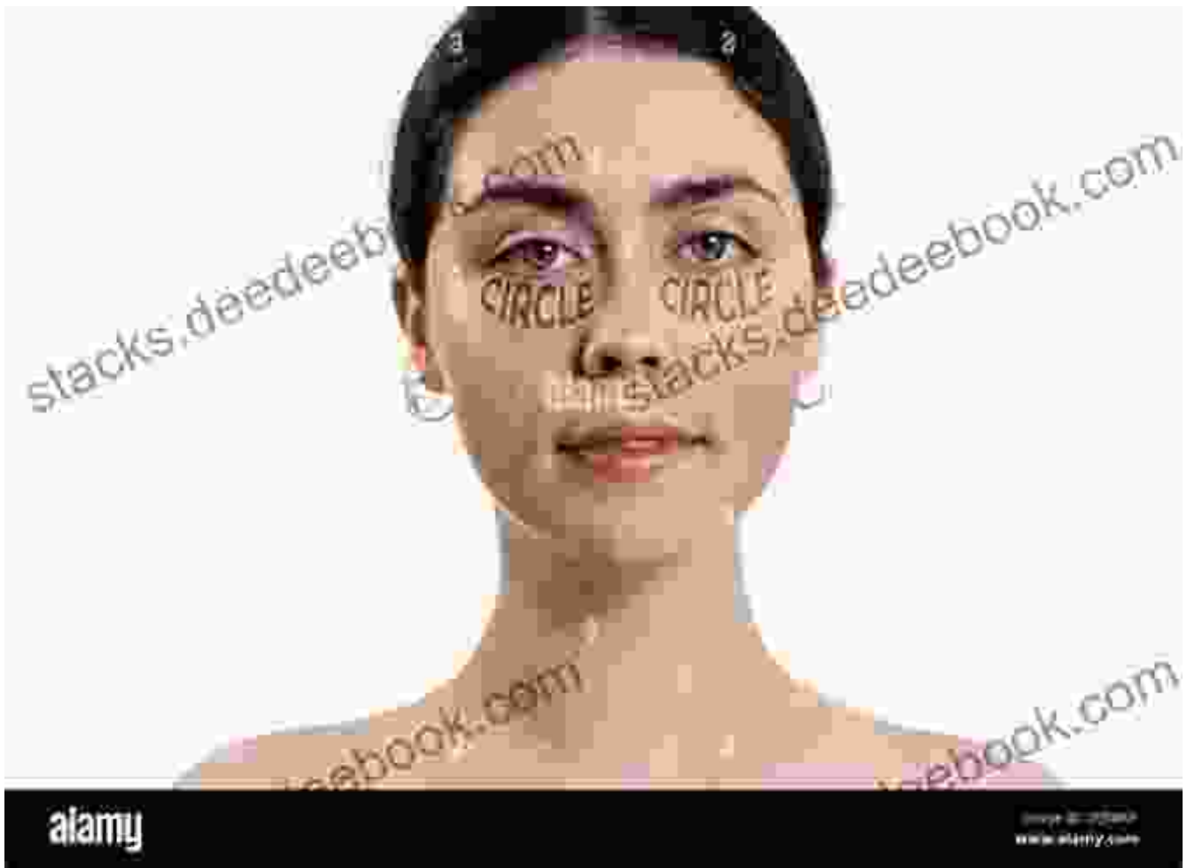
Figure 2: Amelia's character embodies the psychological complexities that drive love's darker aspects.