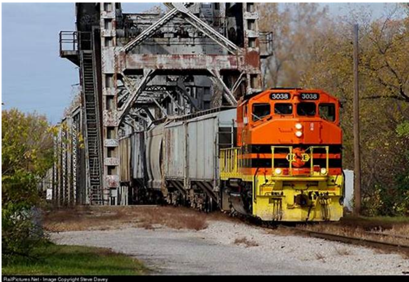
A Huron & Eastern Railroad train crossing a bridge in Saginaw, Michigan.

The Huron & Eastern Railroad is a short line railroad that operates in Michigan and Ontario, Canada. It was founded in 1983 and is headquartered in Saginaw, Michigan. The railroad operates a 450-mile network of track in both states.