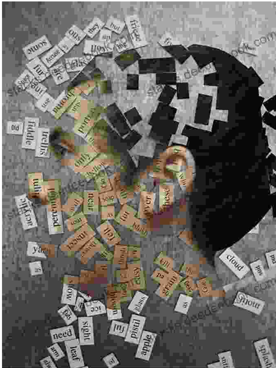
Digital collage by Fanie Viljoen