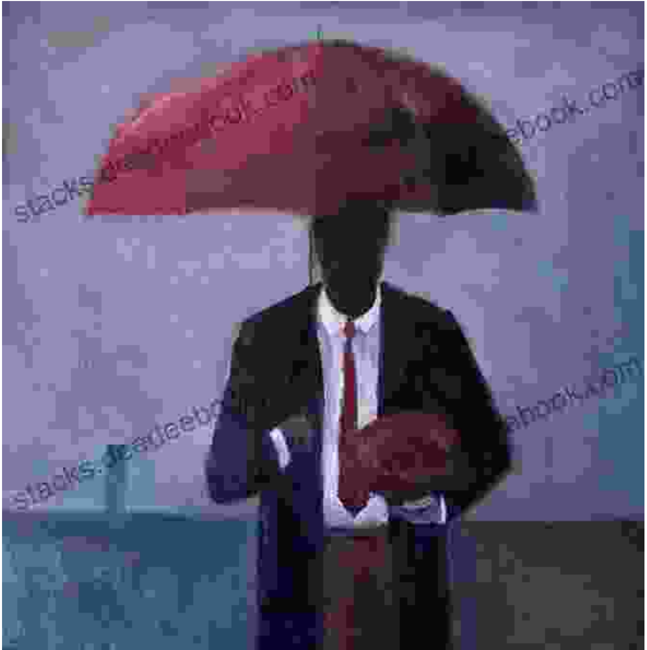
Digital painting by Fanie Viljoen