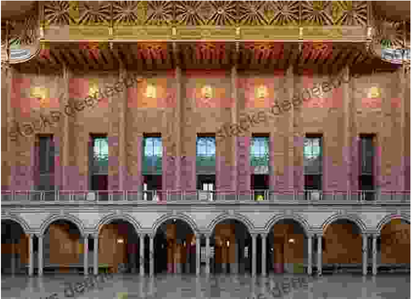
Stockholm City Hall, a masterpiece of National Romantic architecture