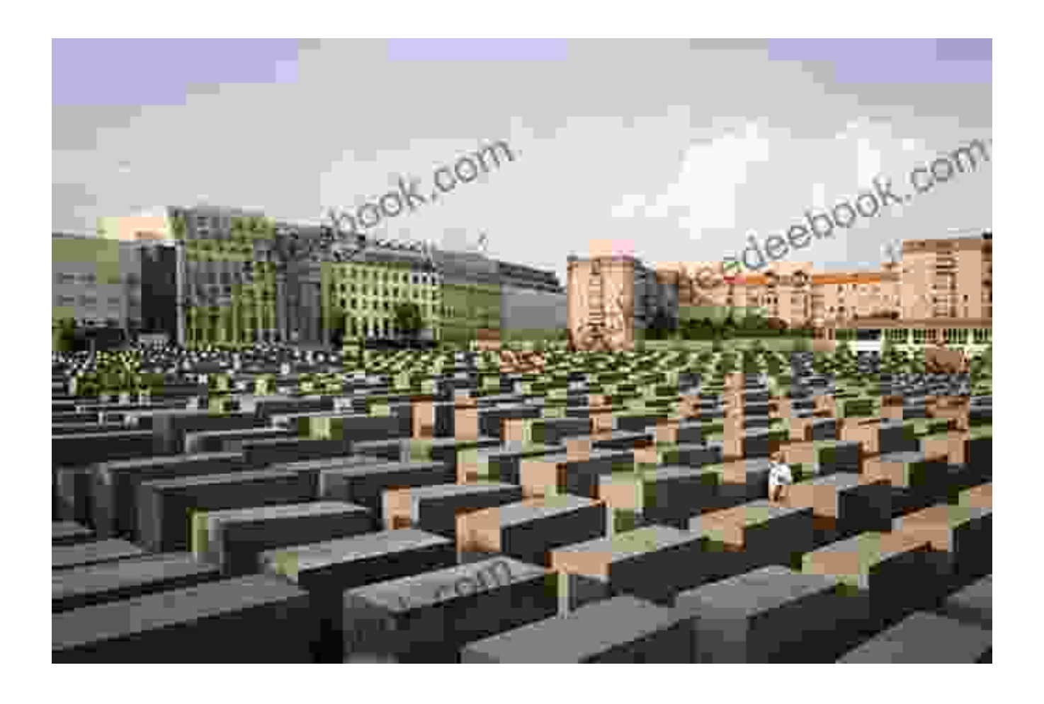
The Holocaust Memorial in Berlin