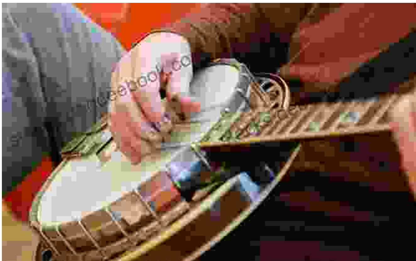
A handcrafted clawhammer banjo with a weathered patina and intricate inlays.

The clawhammer banjo, with its distinctive percussive sound, is another cornerstone of Appalachian musical traditions. Its origins lie in African-American banjo playing techniques, which were adopted and adapted by white musicians in the late 19th century.