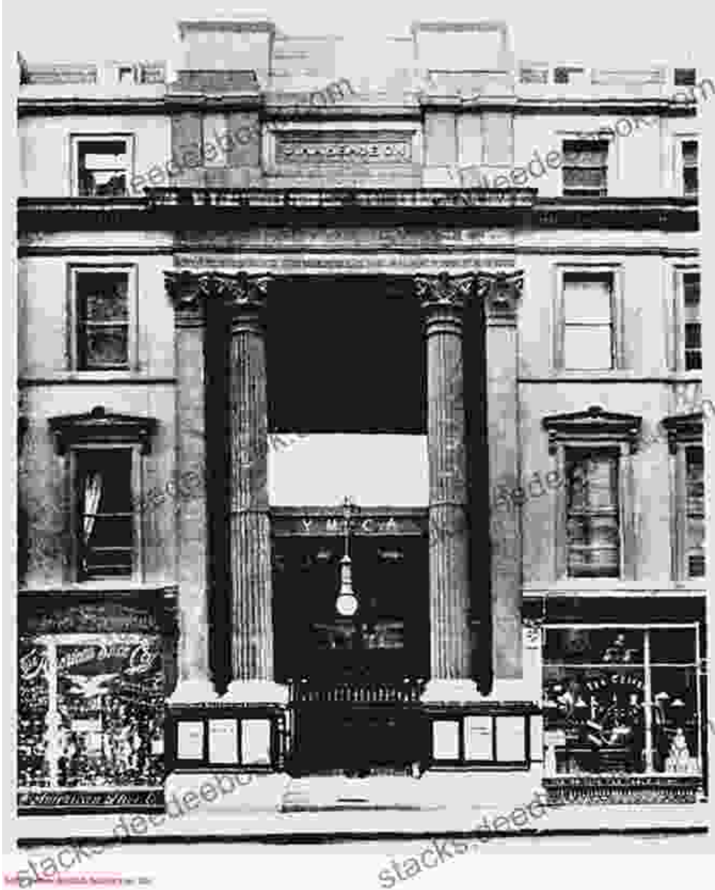
Image: Detail of Barbara Connor, 'London Town, 1907,' showing the bustling Strand.