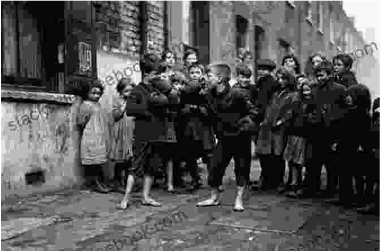
Image: Detail of Barbara Connor, 'London Town, 1907,' showing children playing.